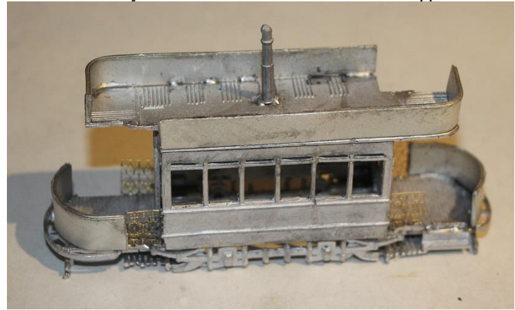
12. Fit the stairs unless you wish to paint them first.

Fit the second under-stair gate against the edge of the bulkhead on the offside of the platform. Fit the trolley mast to the left of the middle of the upper floor.