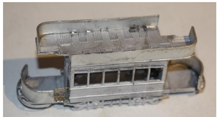
9. Turn model over to fit the steps, lifeguards and life trays.