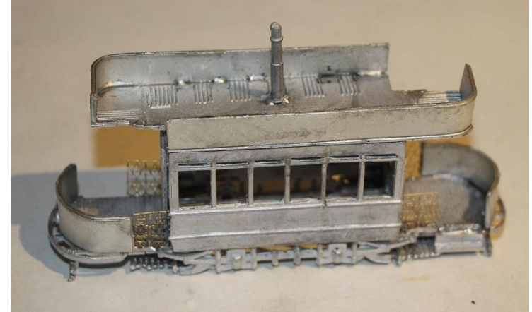
12. Fit the stairs unless you wish to paint them first.

Fit the second under-stair gate against the edge of the bulkhead on the offside of the platform. Fit the trolley mast to the left of the middle of the upper floor.